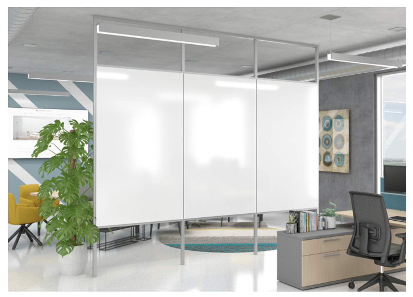
Intersection Divider System in CPS Porcelain Markerboards and Anodized Aluminum Frames.