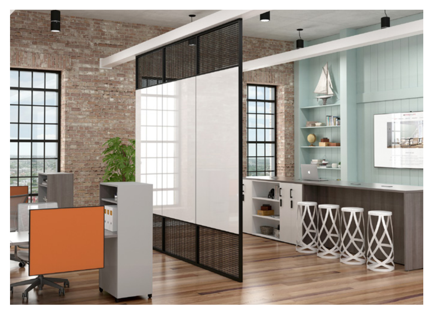
Intersection Divider System with glass markerboards and mesh inserts in Black Powder Coated Frames.