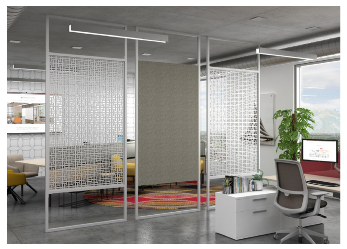
Intersection Divider Panels with Custom Metal Inserts and Acousticor Felt in Anodized Aluminum Frames.