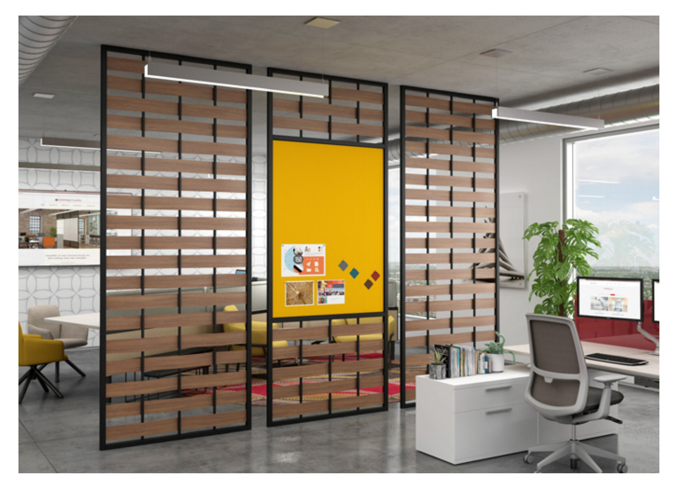
Intersection Divider Panels integrated with Tackable Fabric and Custom Wood Panel Inserts in Black Powder Coated Frames.