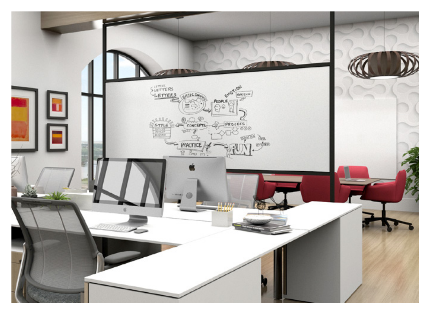
Intersection Divider System with CPS Porcelain Markerboard in Black Powder Coated Frames.