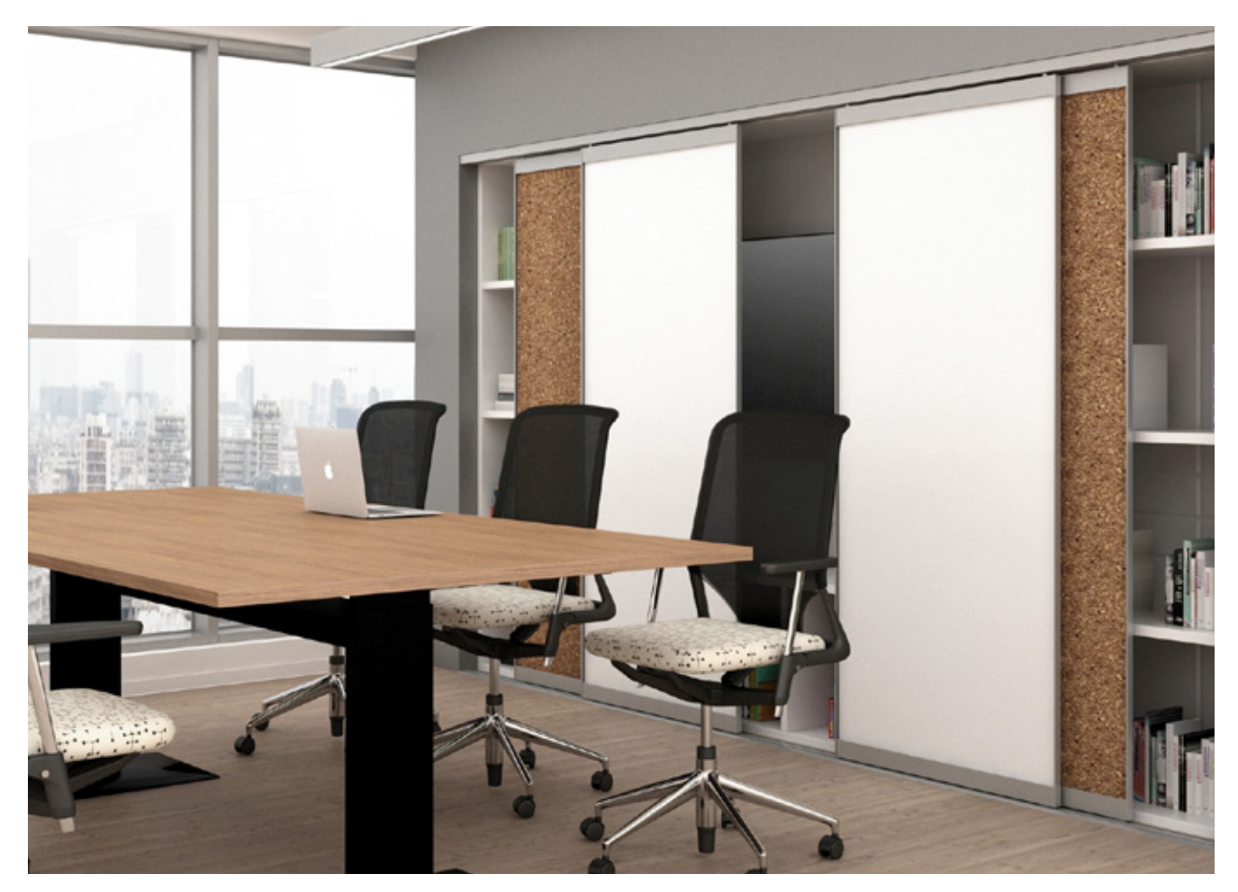
VIP+ Bottom Rolling Sliding Wall Panels in CPS Porcelain Markerboards and Custom Cork.