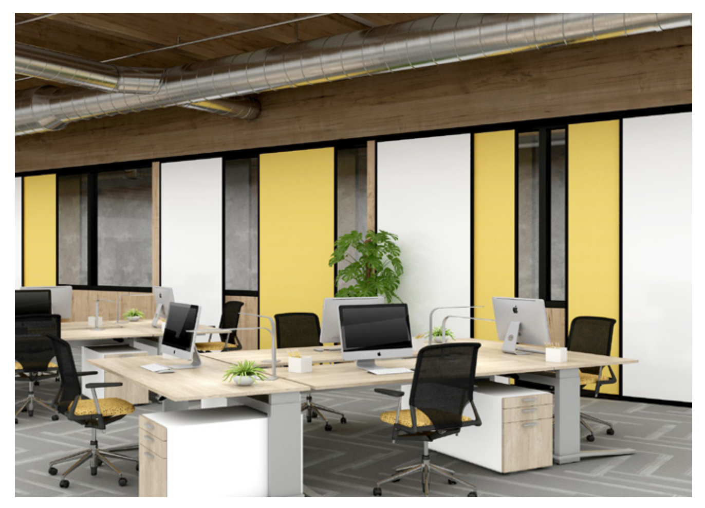
VIP+ Bottom Rolling Sliding Wall Panels with CPS Porcelain and Acousticor in Black Powder Coated Frames.