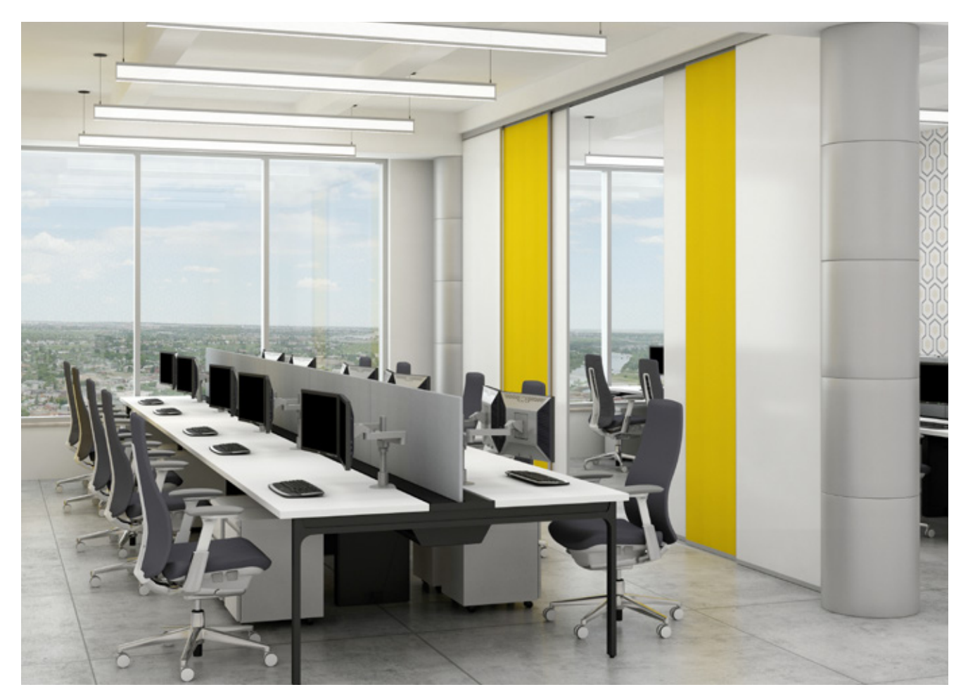
VIP+ Sliding Wall Panel Glass Markerbaords in Designer Speicifed Backpainted Color and Corona White.